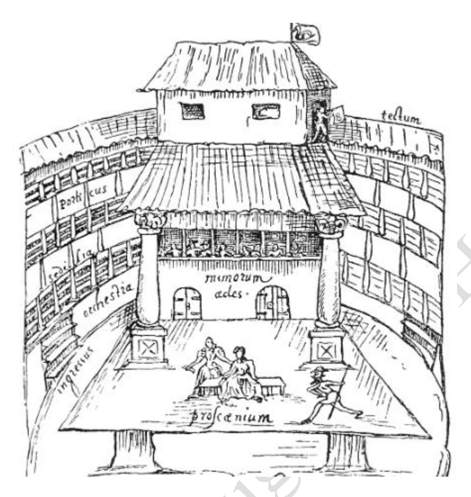
Figure3: Elizabethan Stage, the Swan Theatre