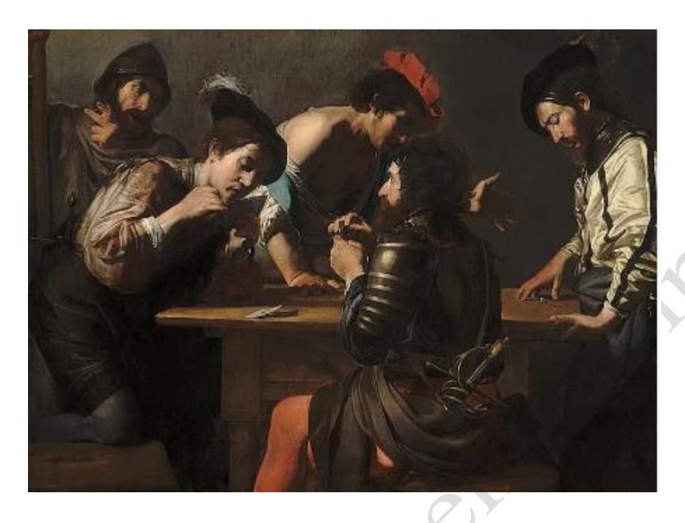
Figure4: Card players by Valentine de Boulogne