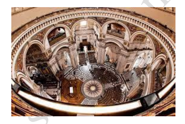
Figure7: St. Paul's Cathedral

• St. Paul's Cathedral is marked as an iconic part of the London Skyline. Travellers in Elizabethan England can experience aesthetic prayers from Monday to Saturday in the evening time. Another historical significance of this place lies in serving as Anglican Episcopal see in England (Rachel Siden, 2022). Since the church is associated with witnessing different religious events along with the funeral of many fathers; it can be distinguished as worth visiting. Another additional part, the marriage of Prince Charles has taken place in this church.