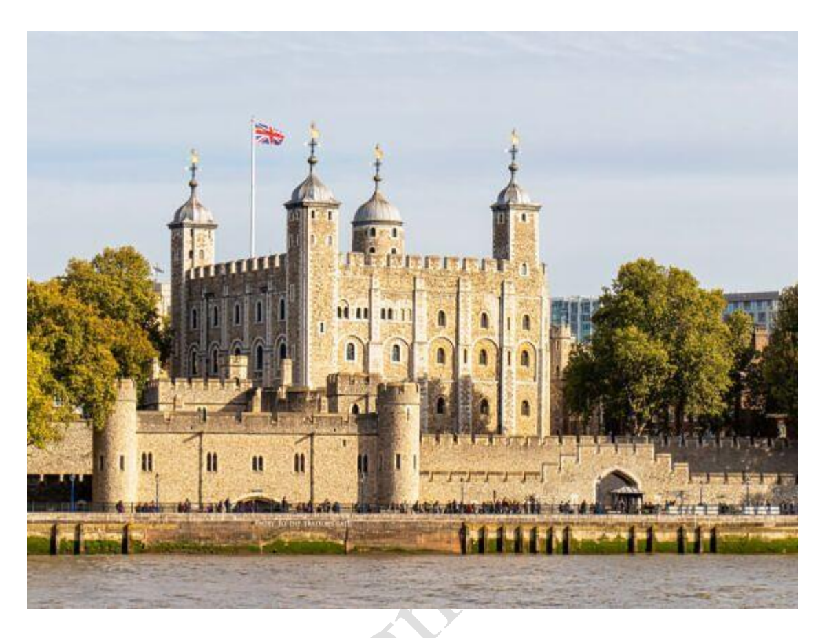
Figure8: The Tower of London