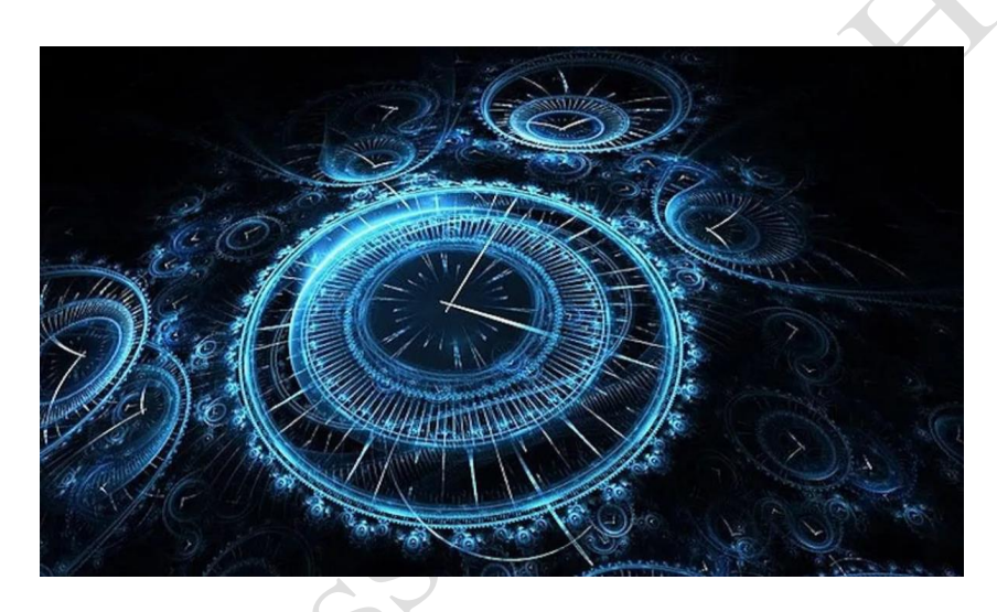
Figure 1: Time Travel